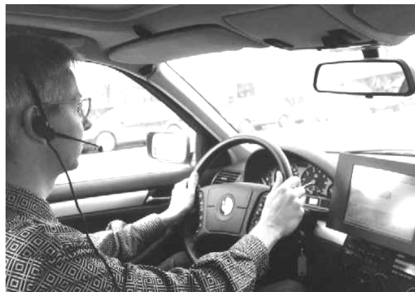
Fig. 2: Microphone and LCD-Display Positions

A hands-free mobile phone is mounted in a car kit; its microphone is located in mid position on the ceiling.