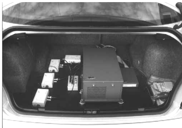
Fig. 1: PLTM Installation

For the German SpeechDat-Car data collection, a standard BMW 318i is used. The mobile recording platform (PLTM) is mounted on shock-absorbers on a 2cm thick plywood base in the car boot. A separate battery feeds the PLTM (Fig. 1).